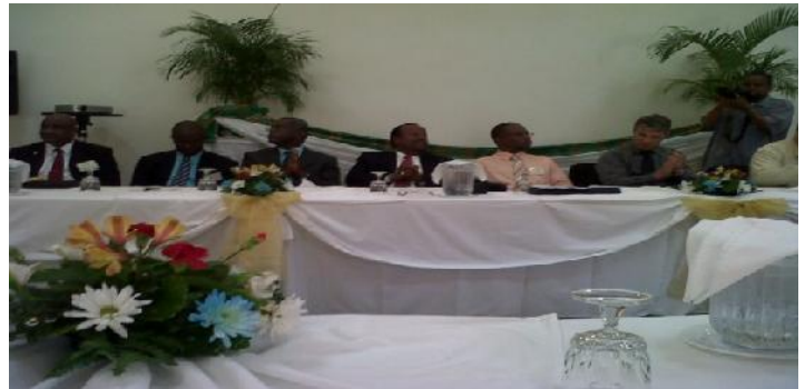
Participants in the P.M.A.C. meeting

Soon after his address, country reports were presented. These focused on the state of affairs of the individual Port Authorities. The presentation that left an indelible impression on my mind was that of the Port Authority of Montserrat. What impressed me was the way in which the Port Authority of Montserrat was able to re-