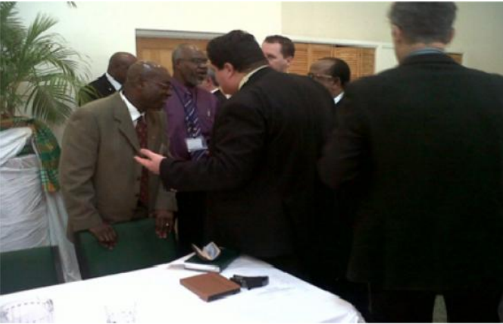
Participants greeting each other!