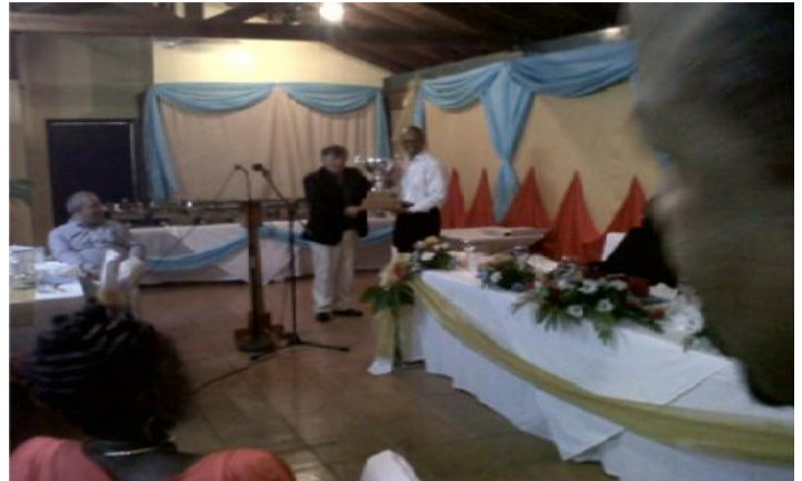
NOVA Port Cup Award being presented to a representative from Barbados

The final event was an Awards Dinner during which the coveted NOVA Port Cup Award was presented to Barbados. This award is presented annually to the Authority with the best operational efficiency and most profitable operations.