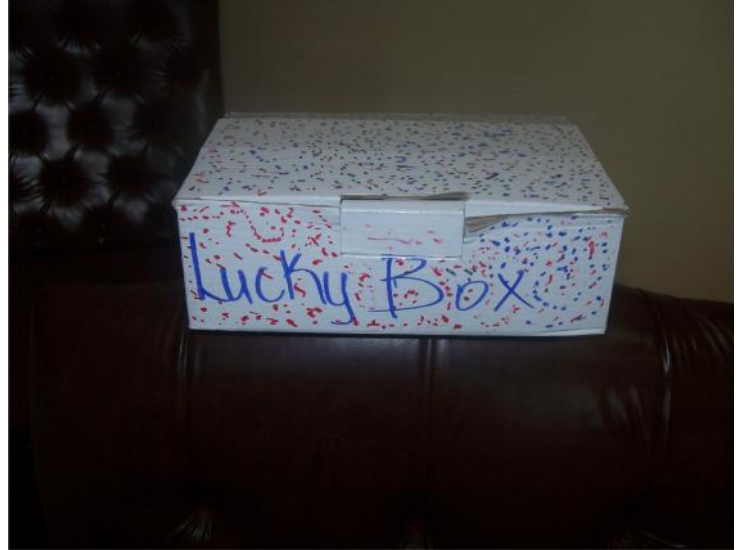
Music Festival Ticket giveaway "Lucky Box"