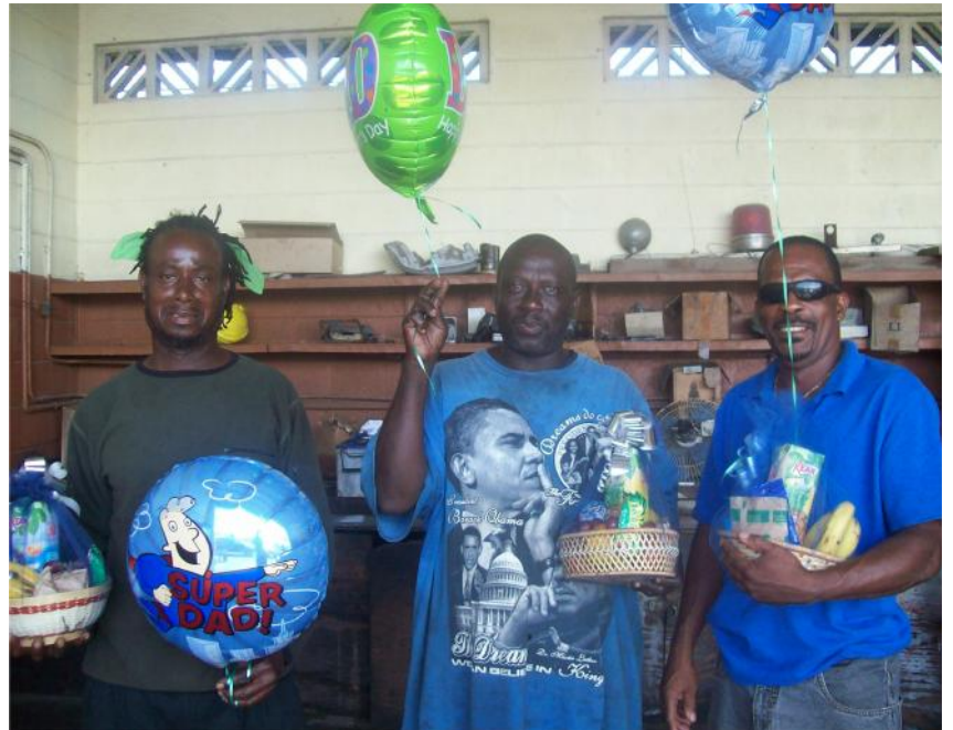
Our men in the Mechanical Engineering Department thankful for their gifts!