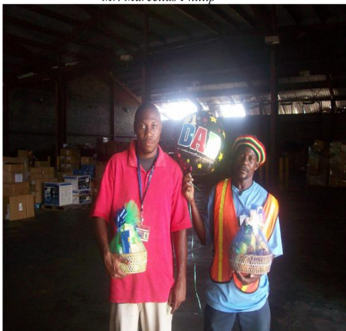
Facility II Fathers!